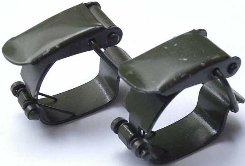
Holder, Small Axe (002.620)