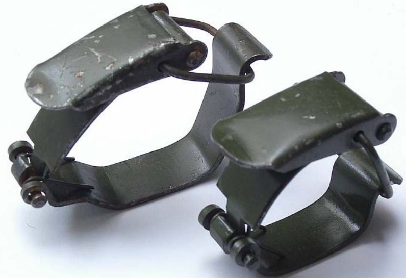
Holder, Big Axe (002.619)

Axe holders come in two sizes (big and small).