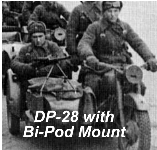
DP-28 with Bi-Pod Mount